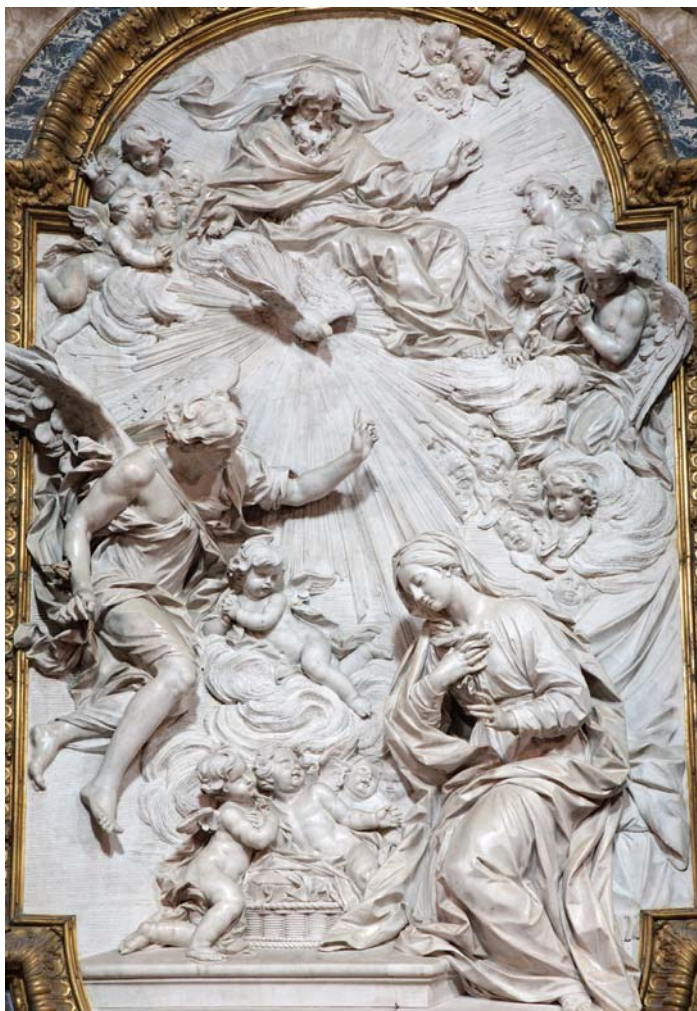
Annunciation baroque relief from chiesa di San Ignazio by Filippo Della Valle, 1649